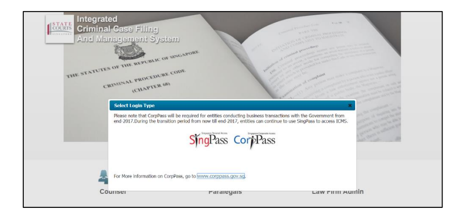
Step 3: If you have clicked on Singpass, you will see the screenshot below.

Note: From now until 31 December 2017, you will be able to choose to login with either SingPass or CorpPass. From January 2018 onwards, you can only login in using CorpPass.