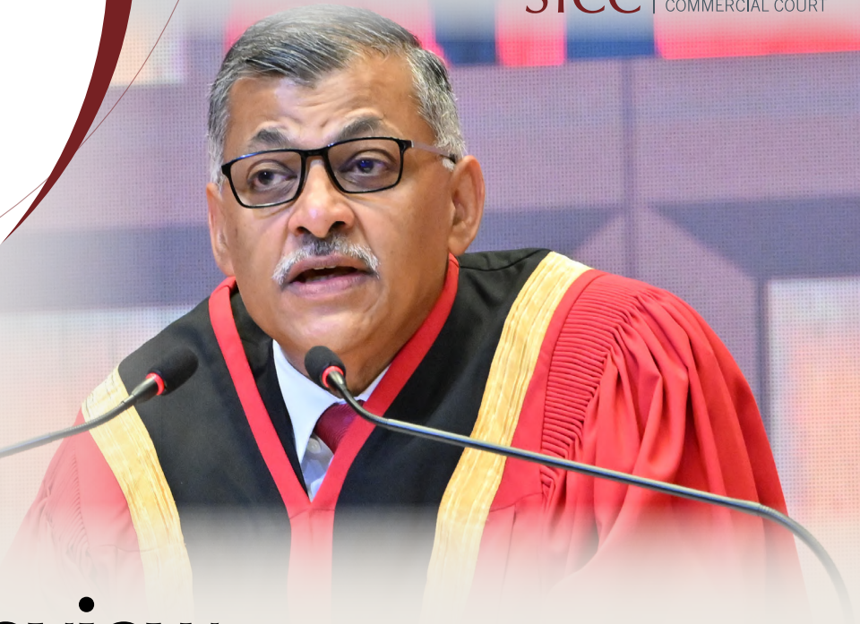
Chief Justice Menon delivering the Opening of Legal Year address on 10 January 2022

2 021 will go down in the books as a year of preparation and recovery. If one word could define the year, it would be “hybrid” as local events started to move cautiously into the physical space, with number restrictions as a result of COVID-19 still enforcing an element of the virtual.