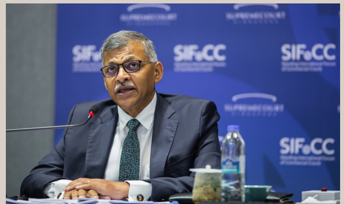
Chief Justice Menon at the third meeting of the Standing International Forum of Commercial Courts (SIFoCC)

The afternoon session opened with “ The New Singapore International Commercial Court Rules ” and gave an overview of its key features and user perspectives while the final presentation entitled “ The Role of Commercial Courts in Cross-Border Insolvency Disputes ” explored the purpose and promise of commercial courts in the area of cross-border insolvency.