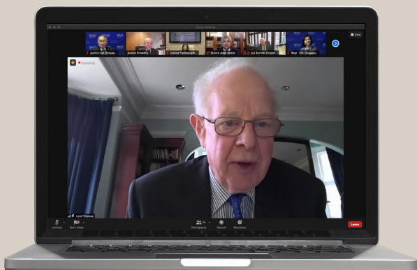
Lord John Thomas, Chair of the SIFoCC Steering Group giving updates to participants from over 35 jurisdictions

Delegates from 35 courts spread over 31 countries attended online and included chief justices, judges, senior judicial representatives and renowned speakers from across the globe. SIFoCC members engaged constructively on a variety of topics including third-party litigation funding, international best practices in case management and the use of artificial technology and its impact, among other issues of interest.