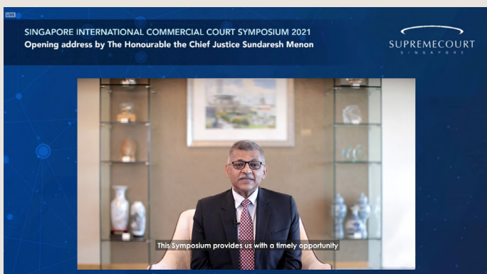
Opening address by the Chief Justice Menon at the SICC Symposium 2021

The full-day event began at 8:45 am with an opening address by the Honourable the Chief Justice Sundaresh Menon and closed at 6 pm following a highly engaging session “ In Conversation with the Honourable Justice Quentin Loh ”. These two sessions bookended an information-packed seminar divided into four key presentations designed to look at the latest trends and developments in international dispute resolution.