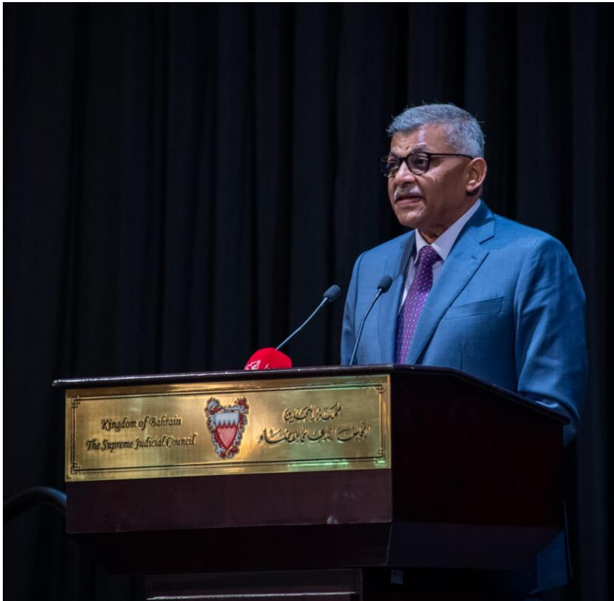
Chief Justice Menon delivering the address “The Transnational System of Commercial Justice and the Place of International Commercial Courts” on 9 May 2023

Jointly issued by: Bahrain Courts Singapore Courts