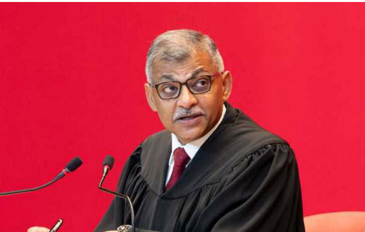
▲ Chief Justice Sundaresh Menon, delivering his speech at the Mass Call 2022.