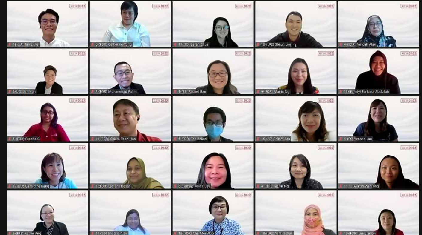
Participants at the FJC All-In 2022: Future In Motion.