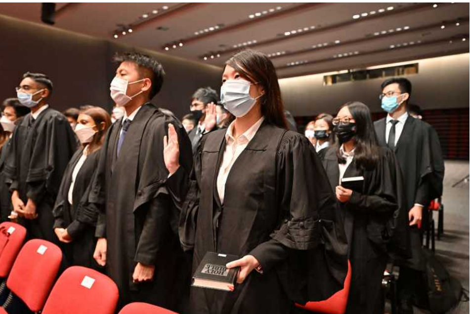
▲ Applicants taking their oath at the Mass Call 2022.

Key messages from Chief Justice Menon’s speech (Video) go.gov.sg/mc22vid