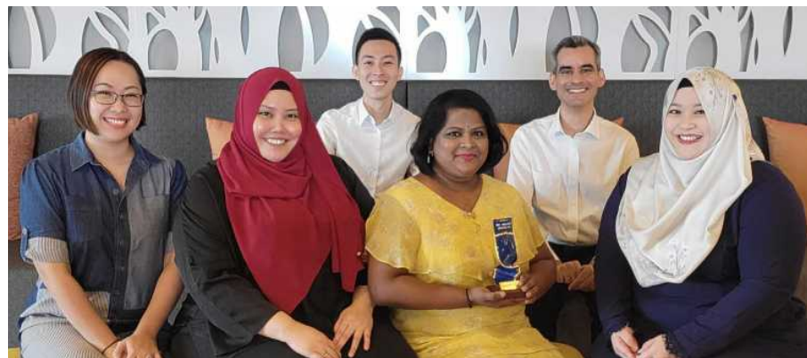
▲ Members of the State Courts Corporate Social Responsibility Committee with the Champions of Good award.