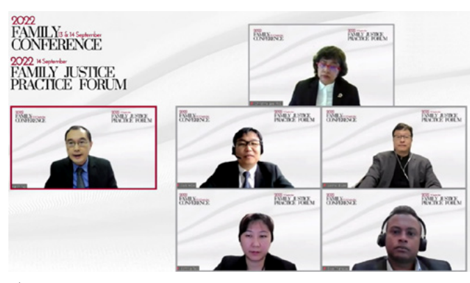
District Judge Kevin Ng helming the session on new collaborative projects in the family justice ecosystem.