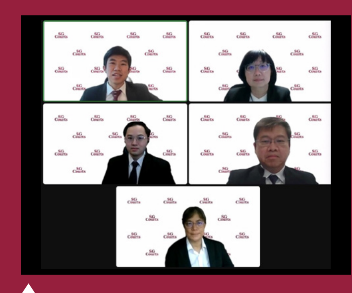
The moderator, panellists and presenters of the webinar.

The webinar is part of the Community Courts and Tribunals Cluster's public education efforts to demystify the law, processes and practices of judicial tribunals, thereby enhancing access to tribunal justice.